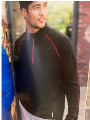
North End -Men's Quarter-Zip Long Sleeve Pullover. BLACK WITH RED TRIM.

If you would rather have a polo shirt you can purchase one from a local business at your cost and the club will pay for the embroidering.