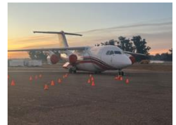
Ready to move to the start line.

Thank you to all the drivers that supported our autocross event season in 2024. Watch for our 2025 autocross dates on Motorsportreg.com .