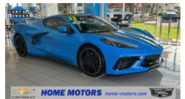
2022 Corvette Stingray 2LT Mileage 2,676