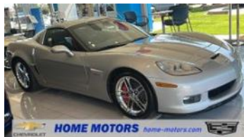
2008 Corvette Z06 Mileage 1,211