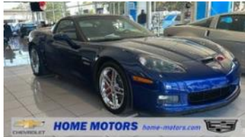
2007 Corvette Z06 Mileage 532