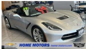
2019 Corvette Stingray 3LT Mileage 17,094