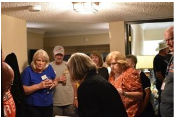
Car Race Game