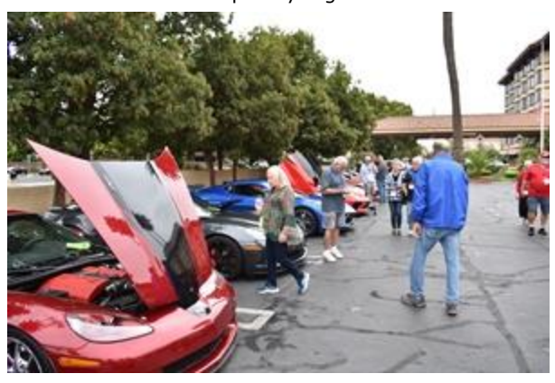
Peoples Choice Car Show