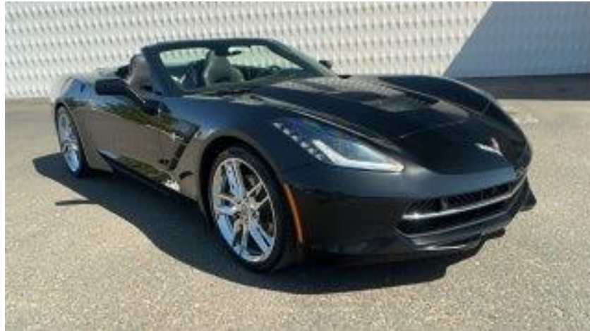
2019 Chevrolet Stingray 3LT Black Interior/Exterior