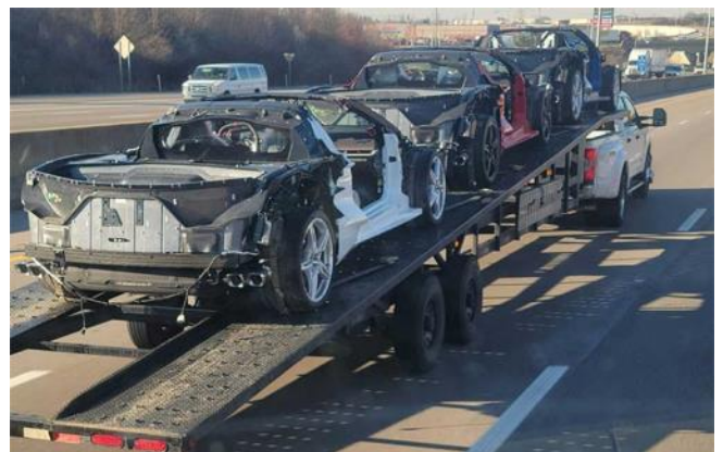
Heading to the crusher.