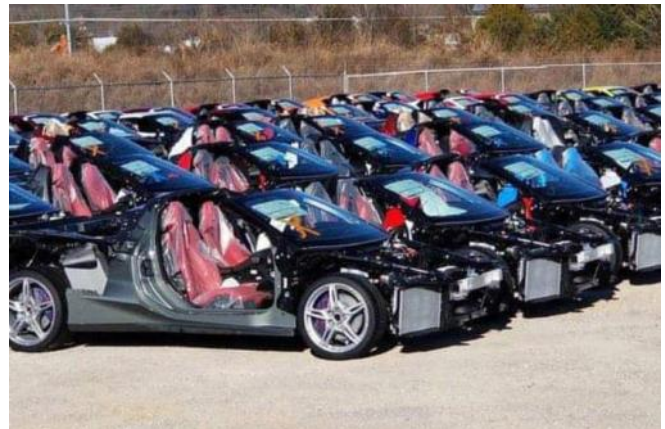
Corvettes from the Assembly line in different stages of completion after tornado.